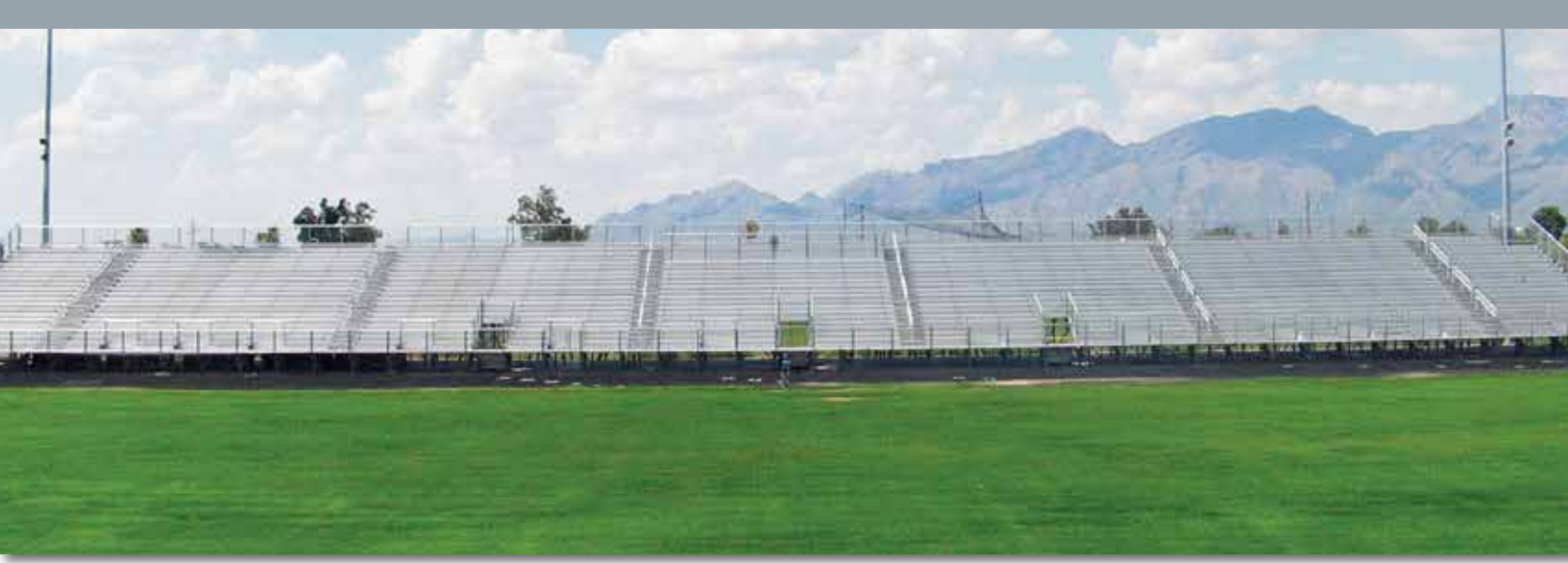
Palo Verde High School - Tucson, AZ