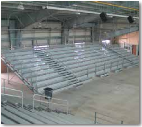
San Patricio County Rodeo - Sinton, TX

permanent grandstand and frame-type system - engineered and constructed to withstand daily use, regardless of weather conditions, size of crowd or type of event.