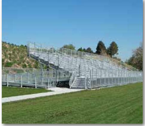
Borah High School - Boise, ID